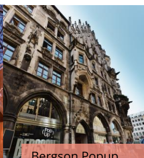
Bergson Popup ...