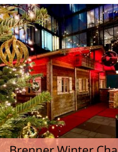
Brenner Winter Chalet ...